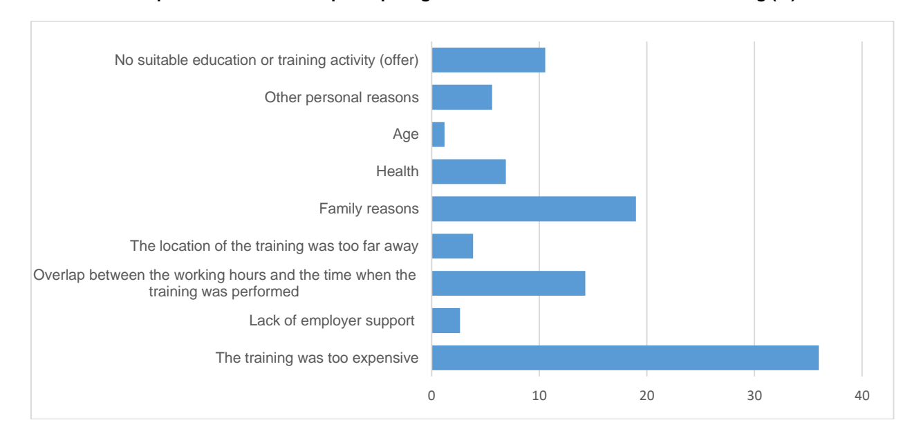
Graph 3. Reasons for not participating in formal or non-formal education/training (%)

Majority of the respondents participates in some sort of informal learning. About two thirds acquire new knowledge by using the computer (65.8%). About 63.6% learn from family members, friends or colleagues, and about 60% learn through TV/ radio, video. 57.5% of the respondents learn from printed materials (books, professional magazines...) and the smallest number learns by visiting museums, libraries, learning centres, etc. (Graph 4).